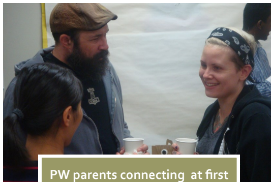
PW parents connecting at first day of school

Our vision is of a school community where all parents feel welcomed, connected and supported. Because we know that when parents are connected, our children benefit.