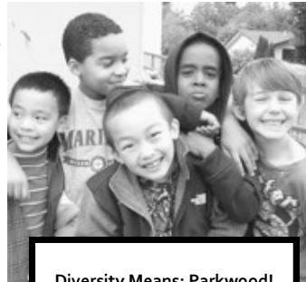
Diversity Means: Parkwood!

If you are wishing you'd had more time to develop your piece, next year's theme has already been announced: "The magic of a moment..." So go ahead and get started. We can't wait to see what you come up with!